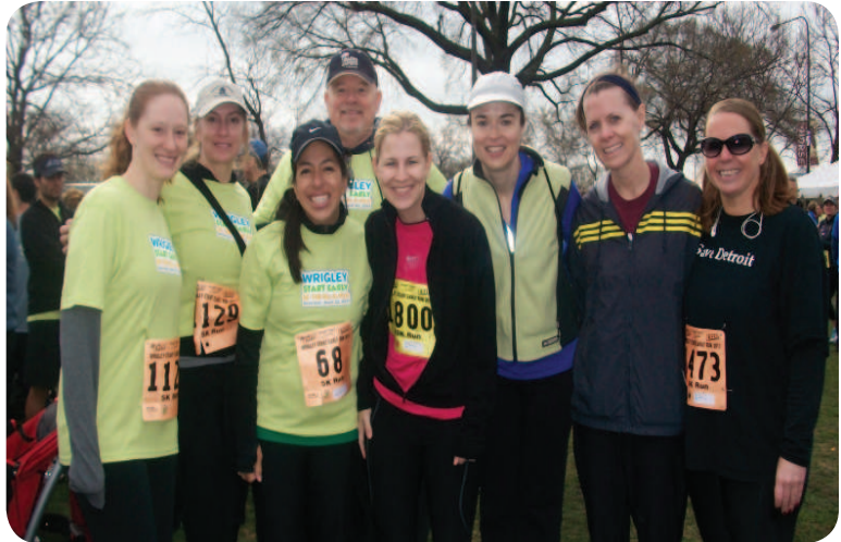
CASA Board members and friends enjoy the race